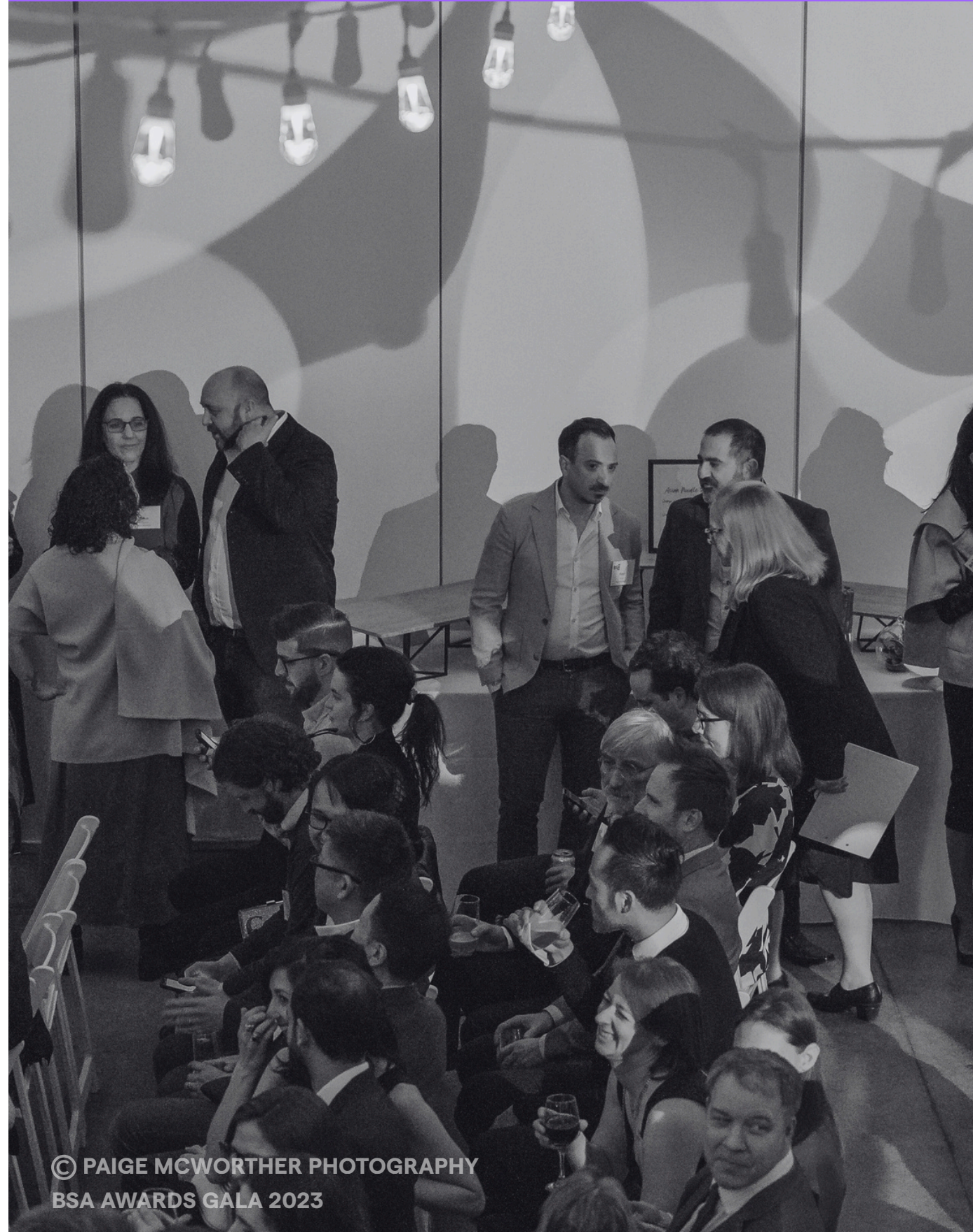
BSA AWARDS GALA 2023